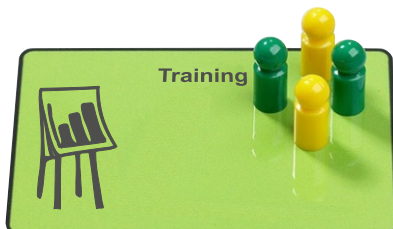
A pic of a small part of one of our games

Running a successful business depends on proper control of the key resources, directing staff time, innovating, planning and co-ordinating