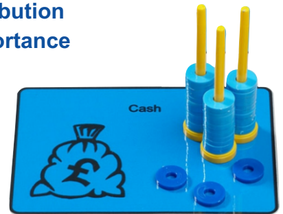
A pic of a small part of one of our games