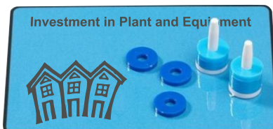
A pic of a small part of one of our games