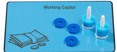
A pic of a small part of one of our games

We can also review internal accounts and performance reports